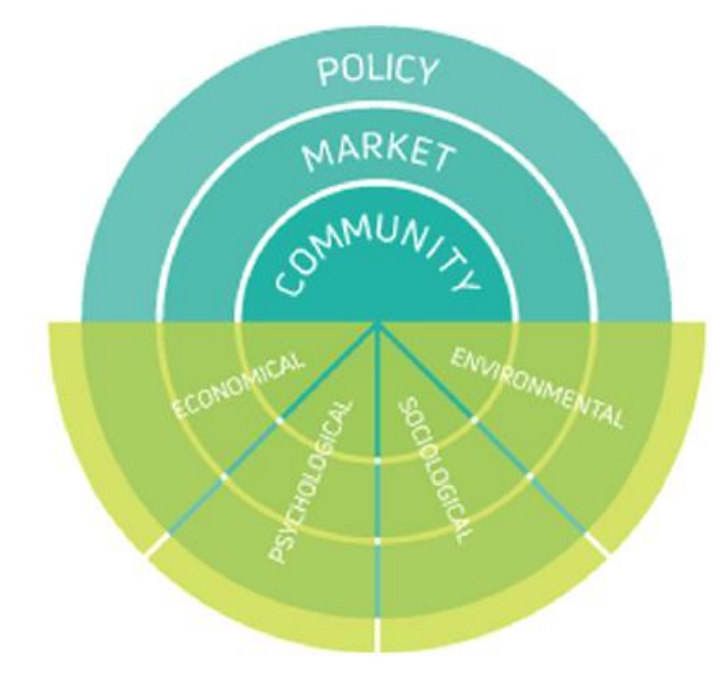
Figure 3 The Value Framework of social acceptance.<sup>17</sup>